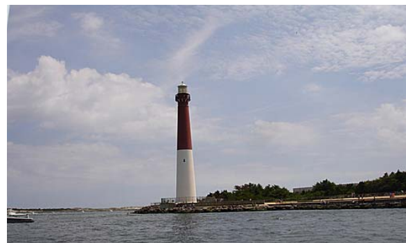
Barnegat Light, New Jersey