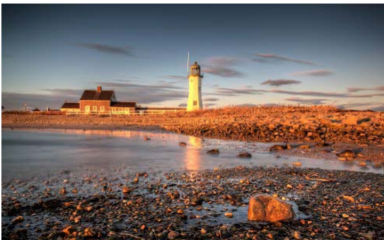
Scituate Light House, Massachusetts