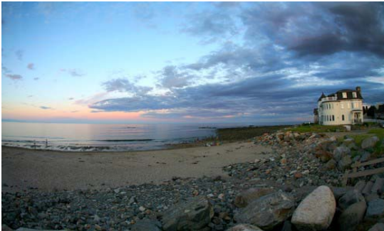
Hampton, New Hampshire